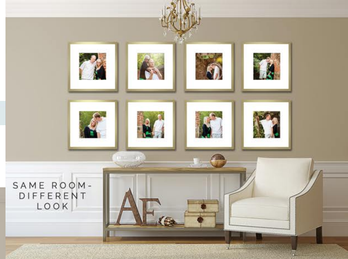
SAME ROOM- DIFFERENT LOOK