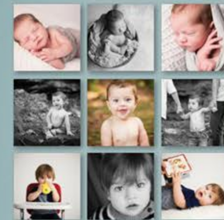
HARMONY GROUPING SHOWN IN CANVAS WRAPS