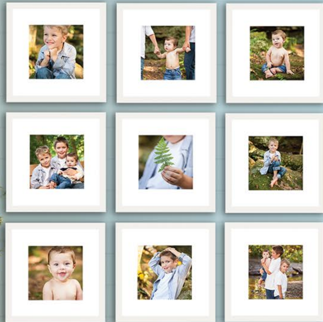
HARMONY GROUPING SHOWN IN LOFT LINE FRAMES