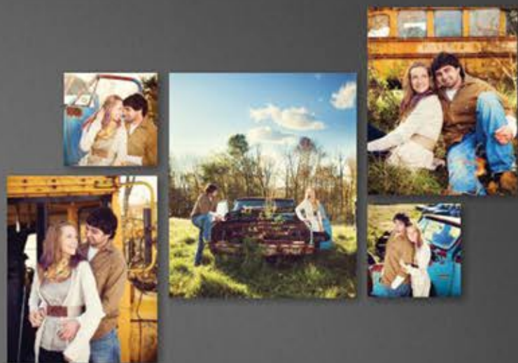
THE ECLECTIC GROUPING 1-20", 2-16", AND 2-10" CANVASES