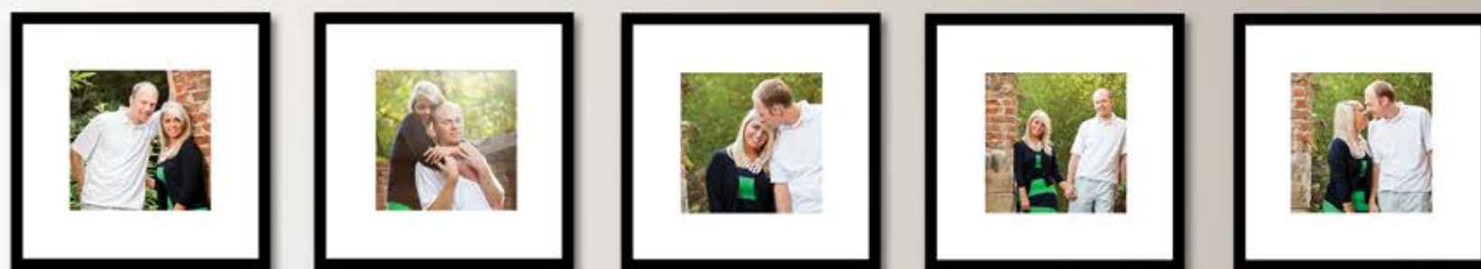
FIVE STANDARD SIZE LOFT FRAMES SHOWN